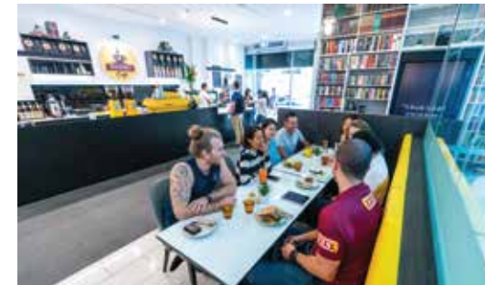
Student kitchen / Student lounge