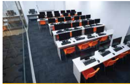
4 Computer rooms